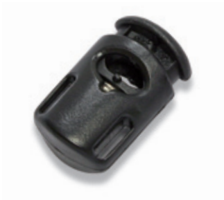
ECL TOASTER A B mat. col.

The Ellipse Cordloc boasts a patented hole alignment feature which eliminates the process of manually compressing the closure to thread the cord. Then, a simple squeeze permanently unlocks the alignment mechanism and securely grip any cord.