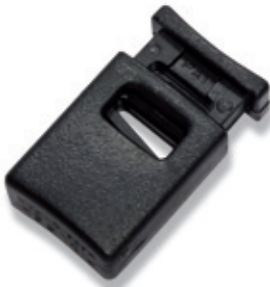
CF STD 4*10 A B mat. col.

The Double Cordloc offers a fashionable functional method of joining cords and sealing bag tops.