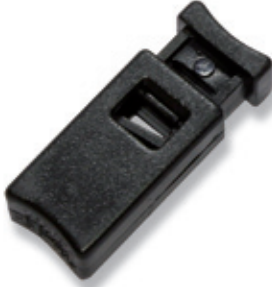
CF MINI 4*4 A B mat. col.

A two piece non-corrosive all-plastic Cordloc.