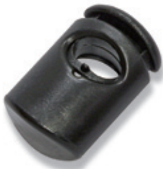
ECL A B mat. col.

The Ellipse Cordloc boasts a patented hole alignment feature which eliminates the process of manually compressing the closure to thread the cord. Then, a simple squeeze permanently unlocks the alignment mechanism and securely grip any cord.