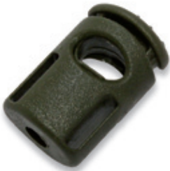
GTSP CORDLOC A B mat. col.

Based on the popular ECL shape, the slotted body makes direct connection to the fabric possible. This feature enables one handed cord release.