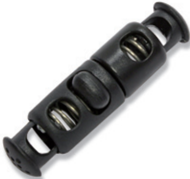
DCL N B mat. col.

An advanced ECL Toaster with self cleaning feature and added ribs on the top to be easily used with gloved hand